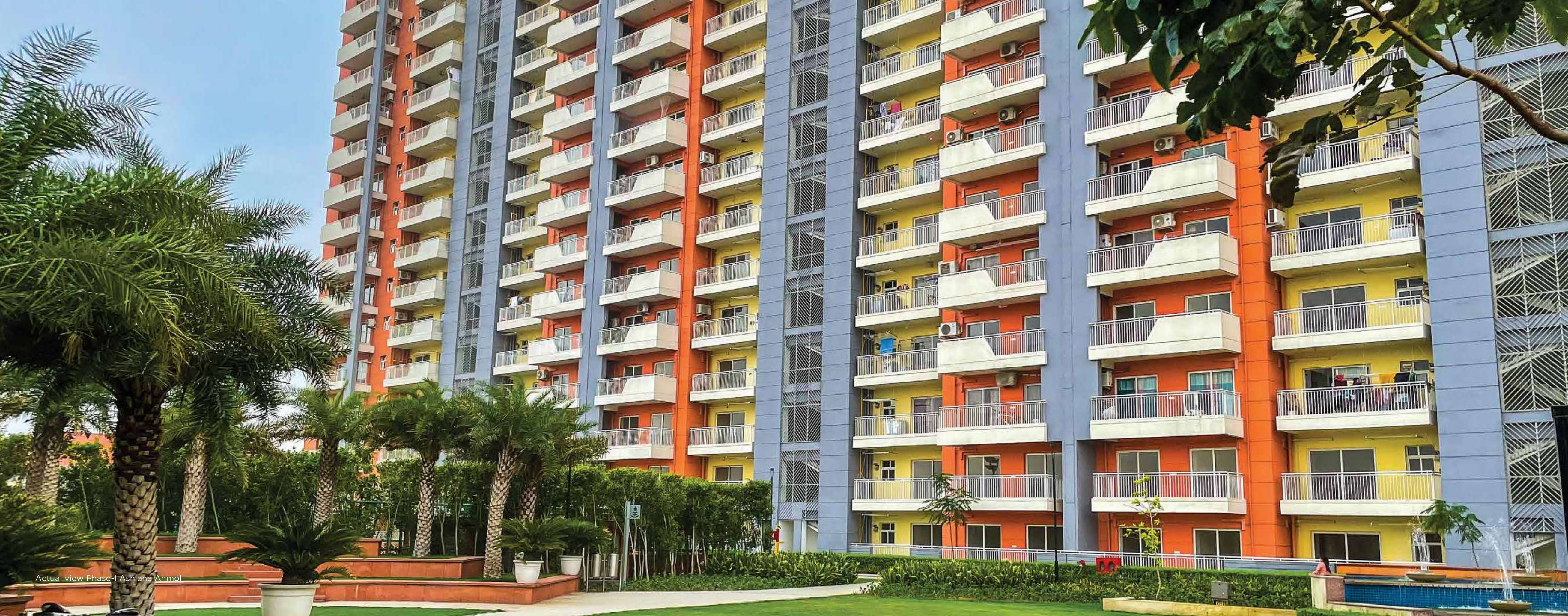
Actual view Phase-I Ashiana Anmol