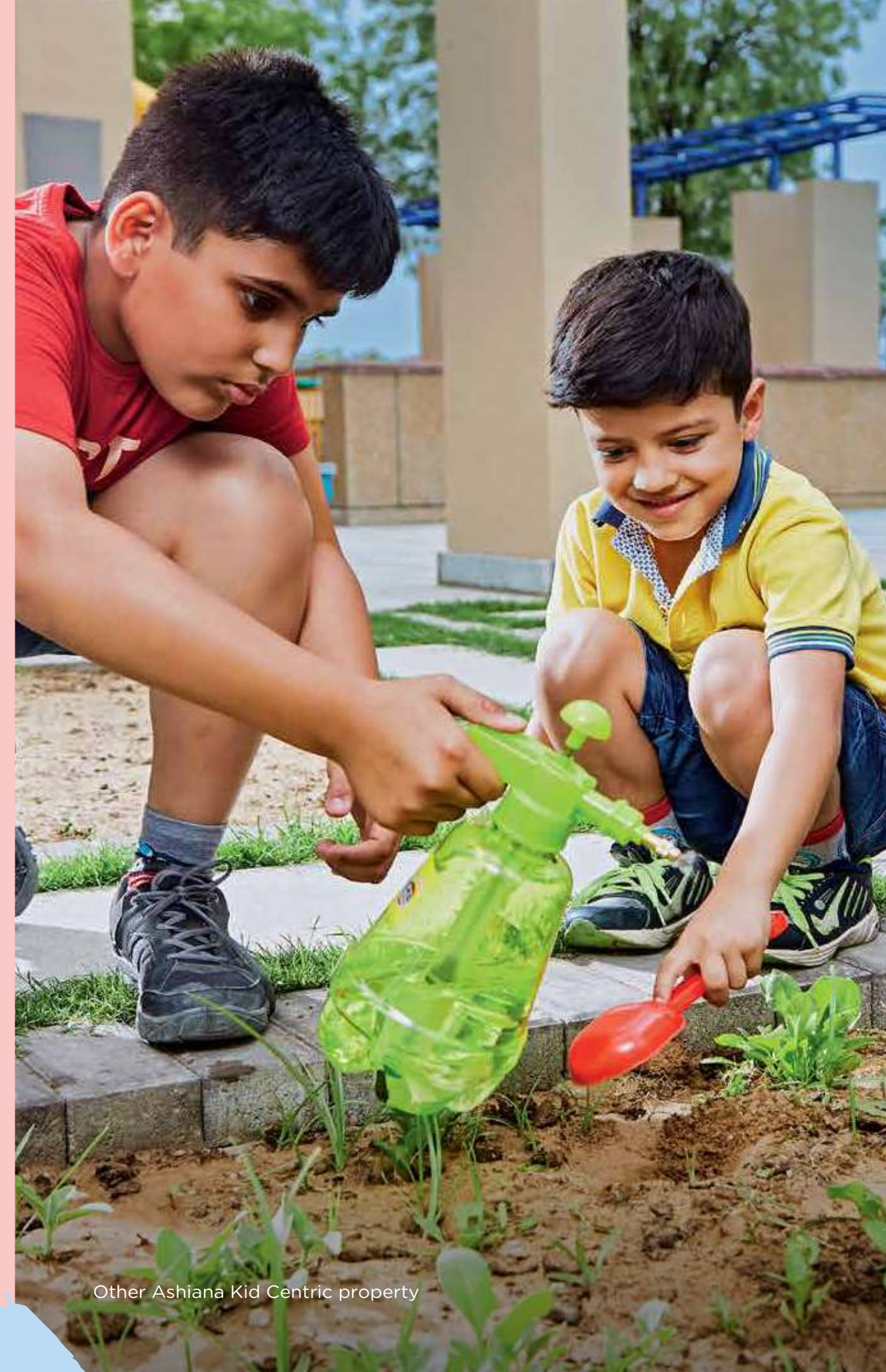
Other Ashiana Kid Centric property

We have combined fun and learning at the playroom, with stimulating toys and games that aid early development. And we all know that smart and playful engagement with children is a great booster for their development.