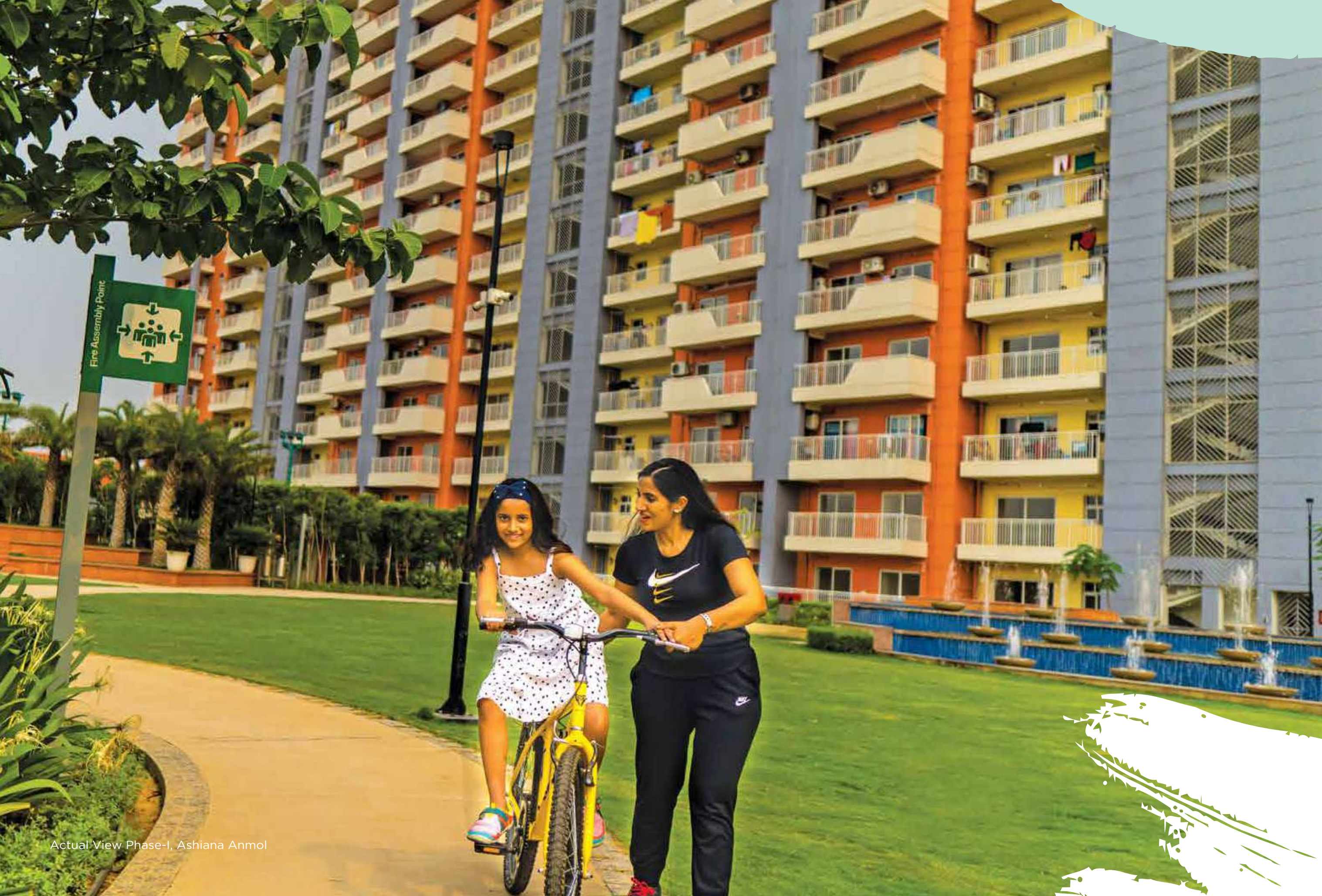
Actual View Phase-I, Ashiana Anmol

Ashiana kids don't just learn things by heart, they learn to follow their heart.