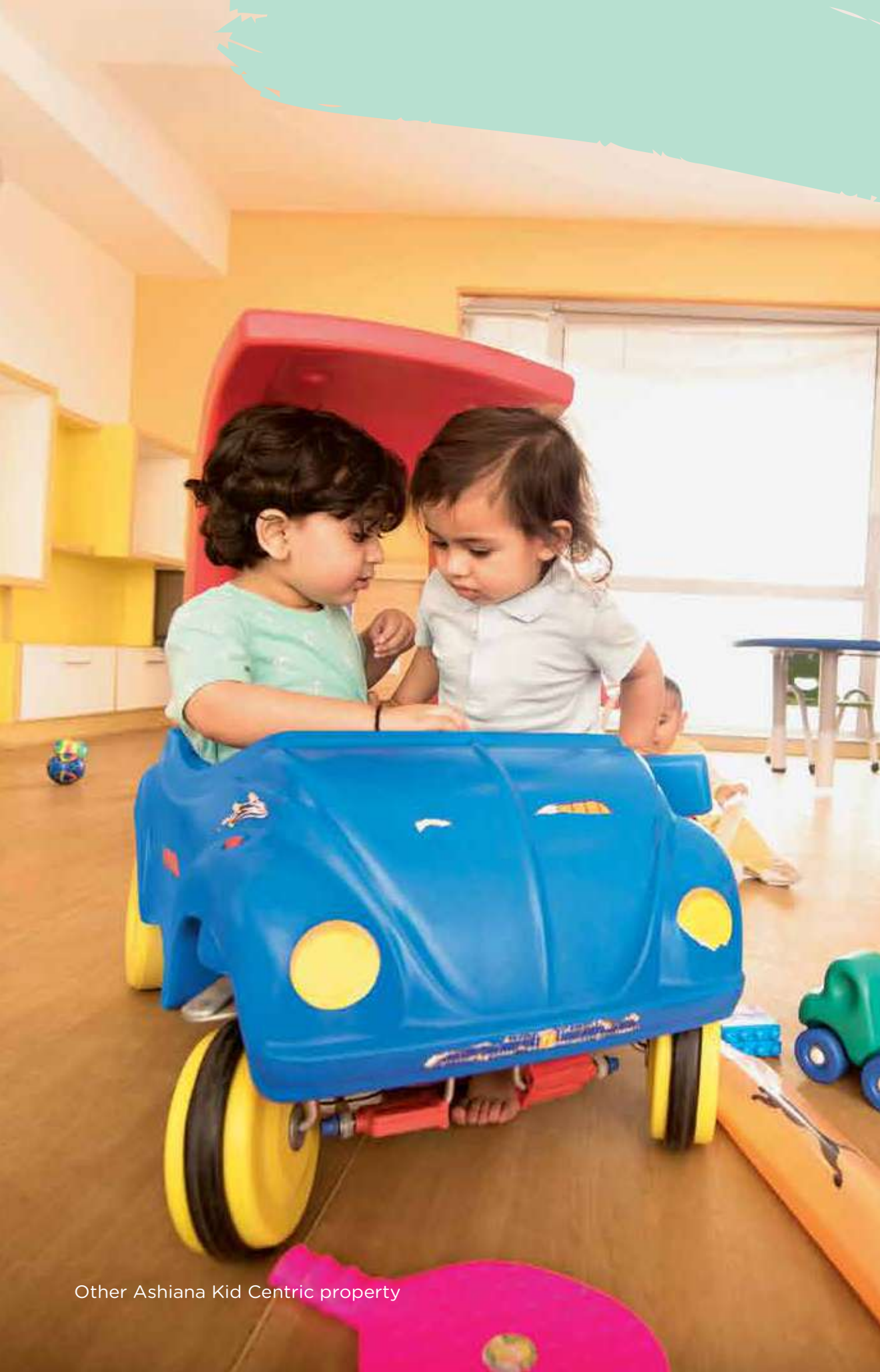
Other Ashiana Kid Centric property