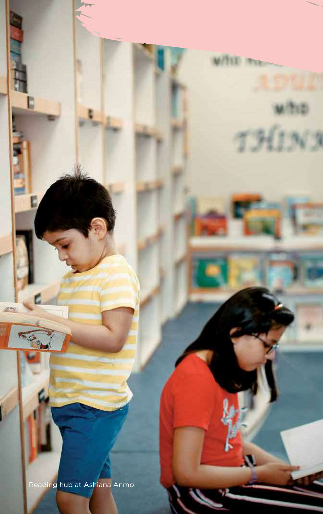
Reading hub at Ashiana Anmol