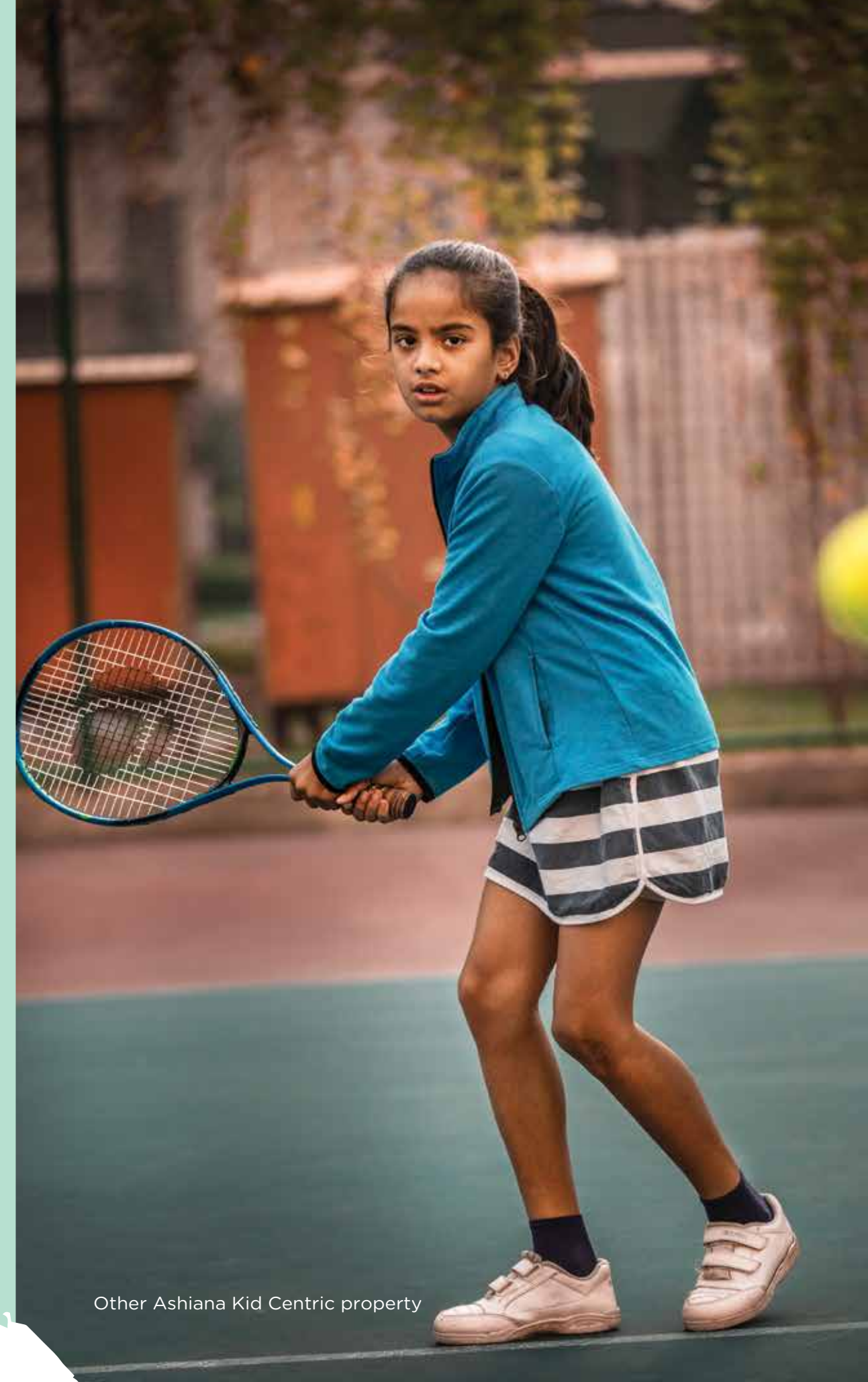
Other Ashiana Kid Centric property

The Reading Hub has a collection of thoughtfully selected books to spark every child's curiosity and love for reading.