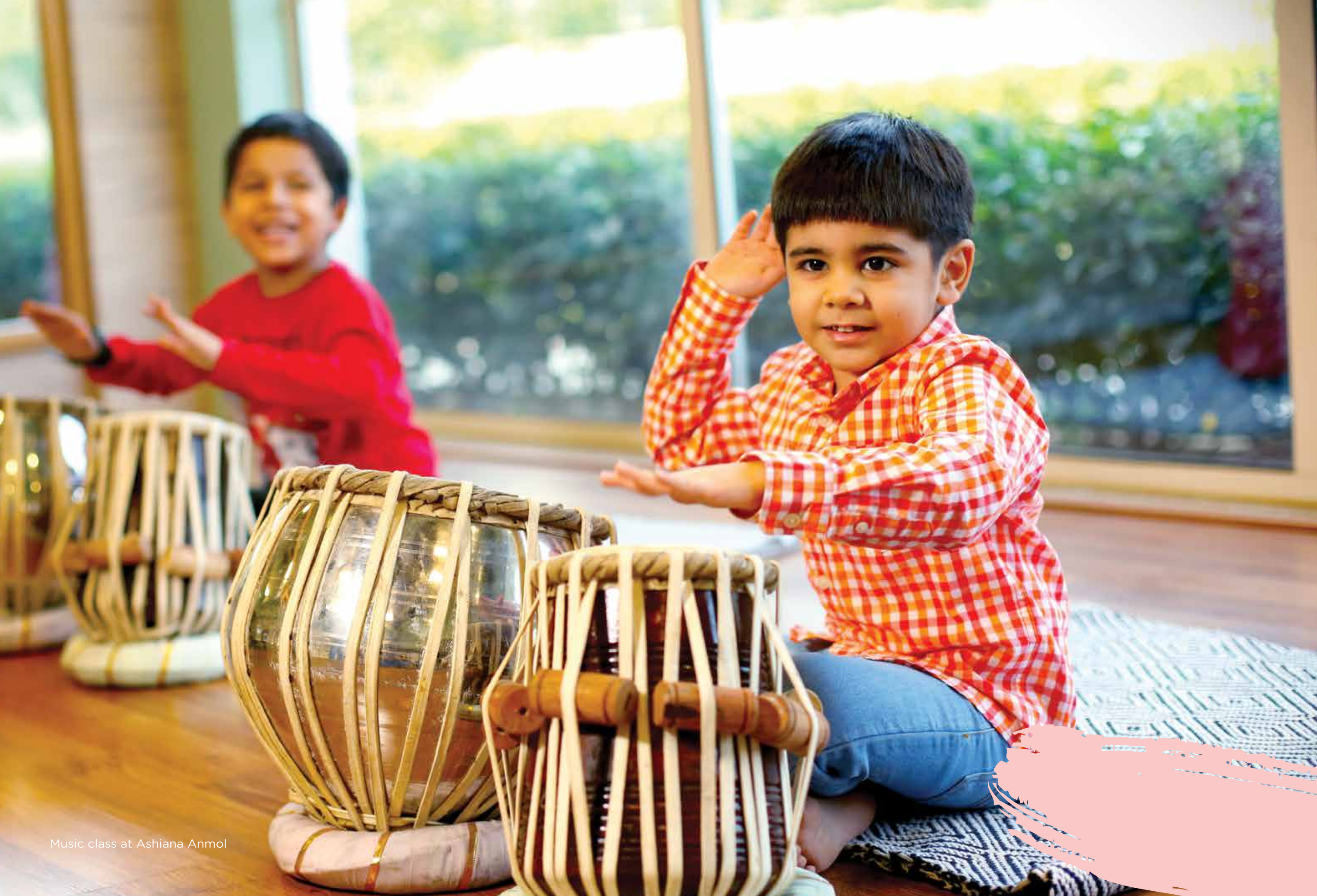
Music class at Ashiana Anmol

Let your child discover their passions and acquire an edge, early in life.