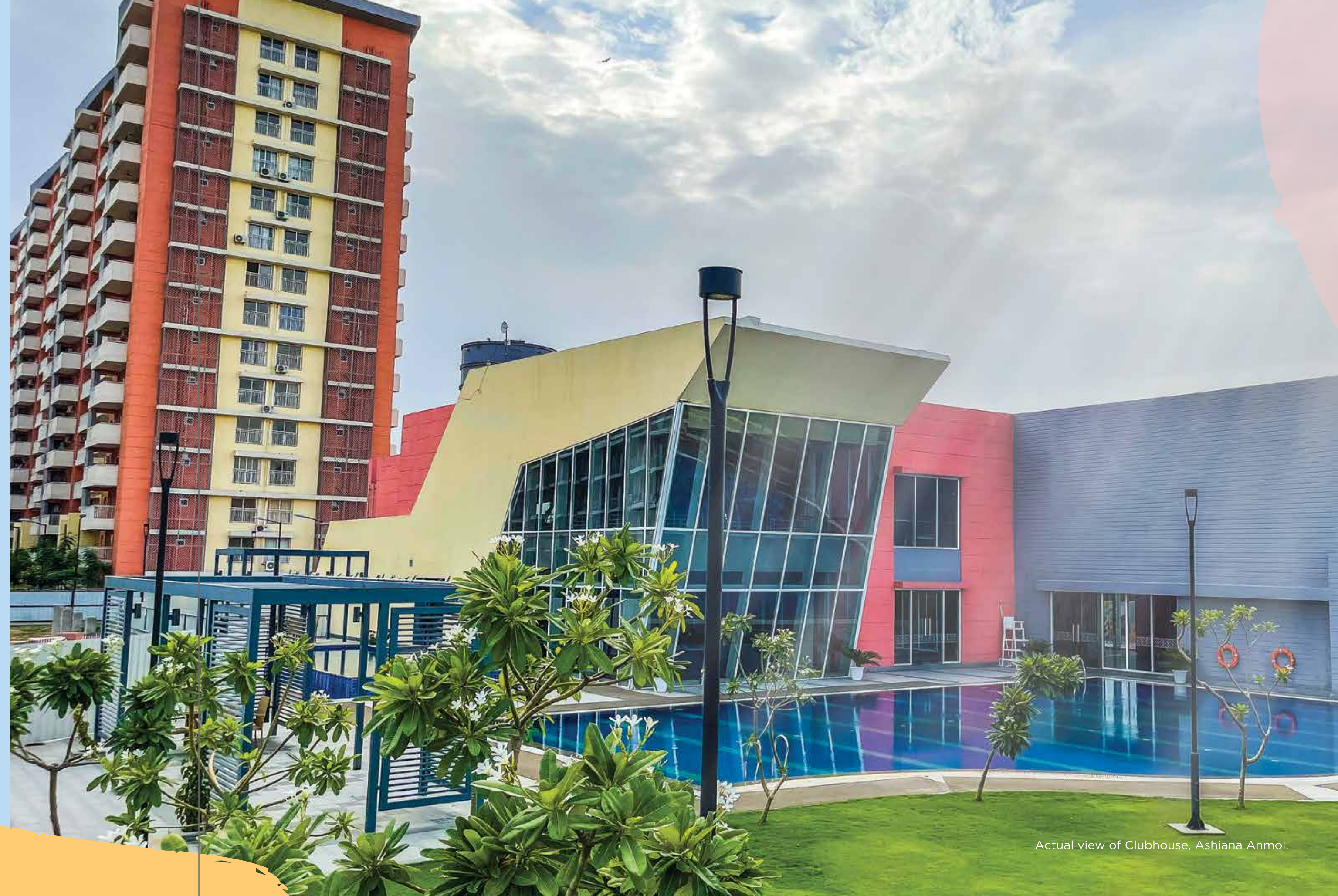
Actual view of Clubhouse, Ashiana Anmol.

Not only the children, but even you will get your own recreational spaces. The Clubhouse here has all the finest amenities, where you can unwind over a game of billiards or simply hang out with friends and make new ones every day. So that while your children are discovering new passions, so are you.