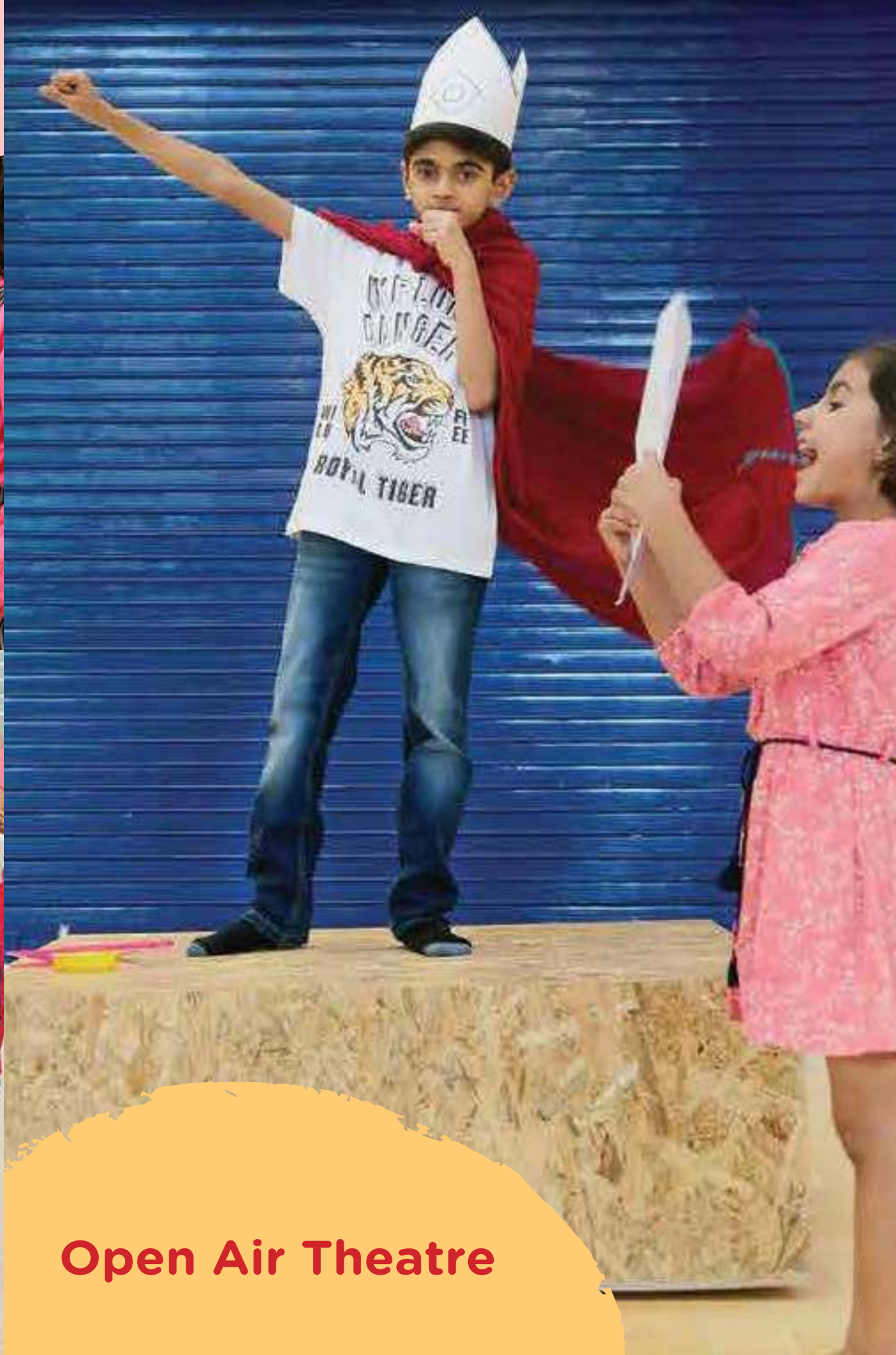
Open Air Theatre