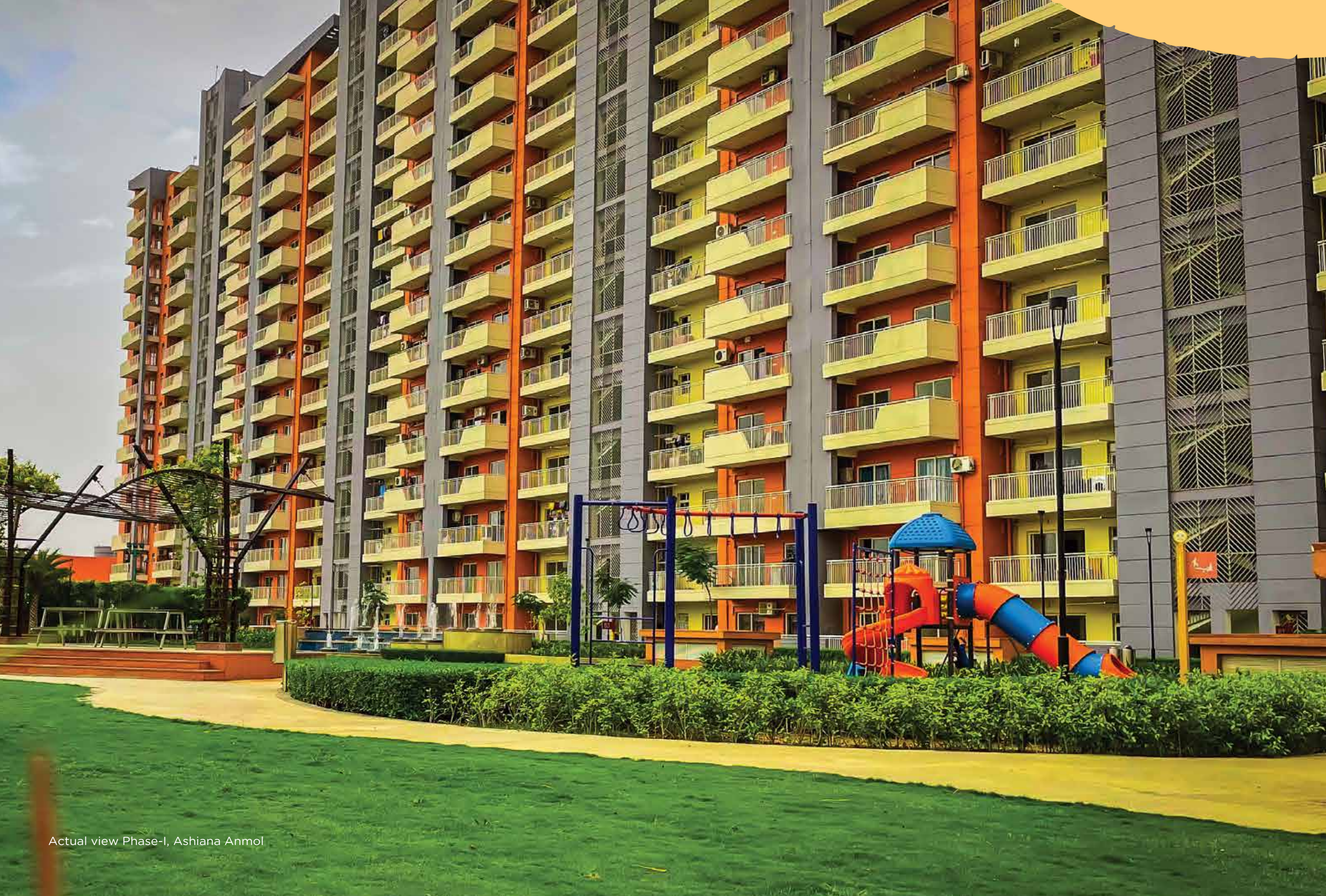
Actual view Phase-I, Ashiana Anmol