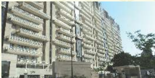
La Lagune, Golf Course Road, Gurgaon