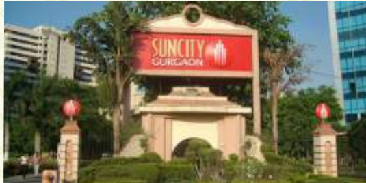
Suncity Township, Golf Course Road, Gurgaon