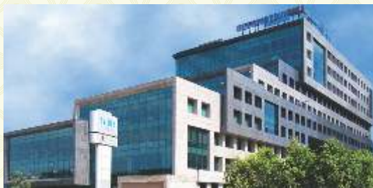
Time Tower, M.G. Road, Gurgaon