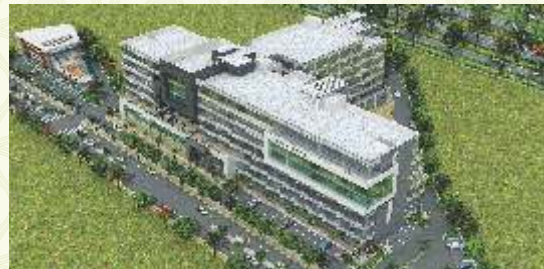
Success Tower, Sector-65, Gurgaon

Suncity Projects is one of the most eminent real estate companies in North India. The Group has built an unshakable reputation for quality, efficiency, trust and meticulous planning. Suncity Projects in North India are famous for offering top quality amenities, superlative designs, timely completion, guaranteed possessions and handing over of projects ranging from Townships to Group Housing to Luxury Apartments. In Corporate & Retail space Suncity Projects offers Shopping Malls to Office Complexes. The organisation is backed with the unmatched experience and expertise of two of India's most reputed business conglomerates - The Essel Group and the Action Group.