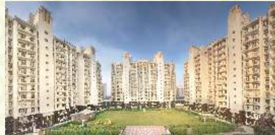
Essel Tower, M.G. Road, Gurgaon