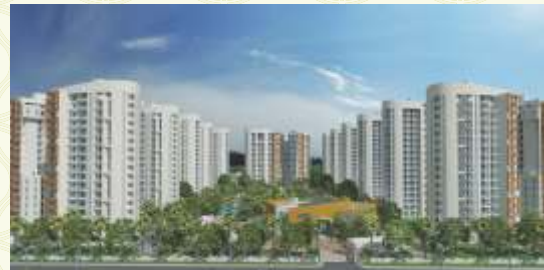
Parikrama, Sector-20, Panchkula