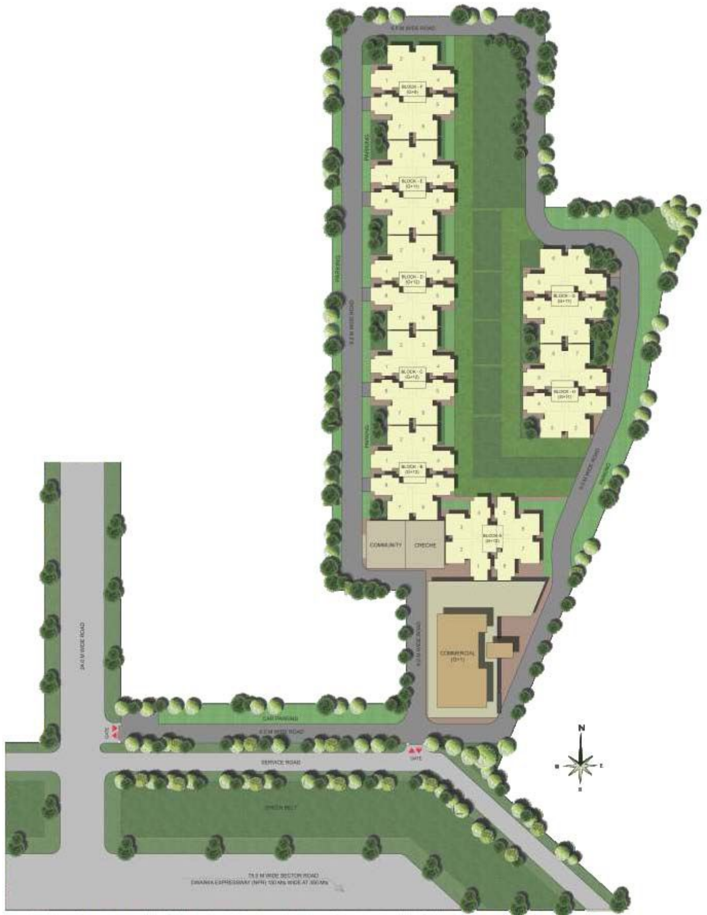
SITE LAYOUT PLAN