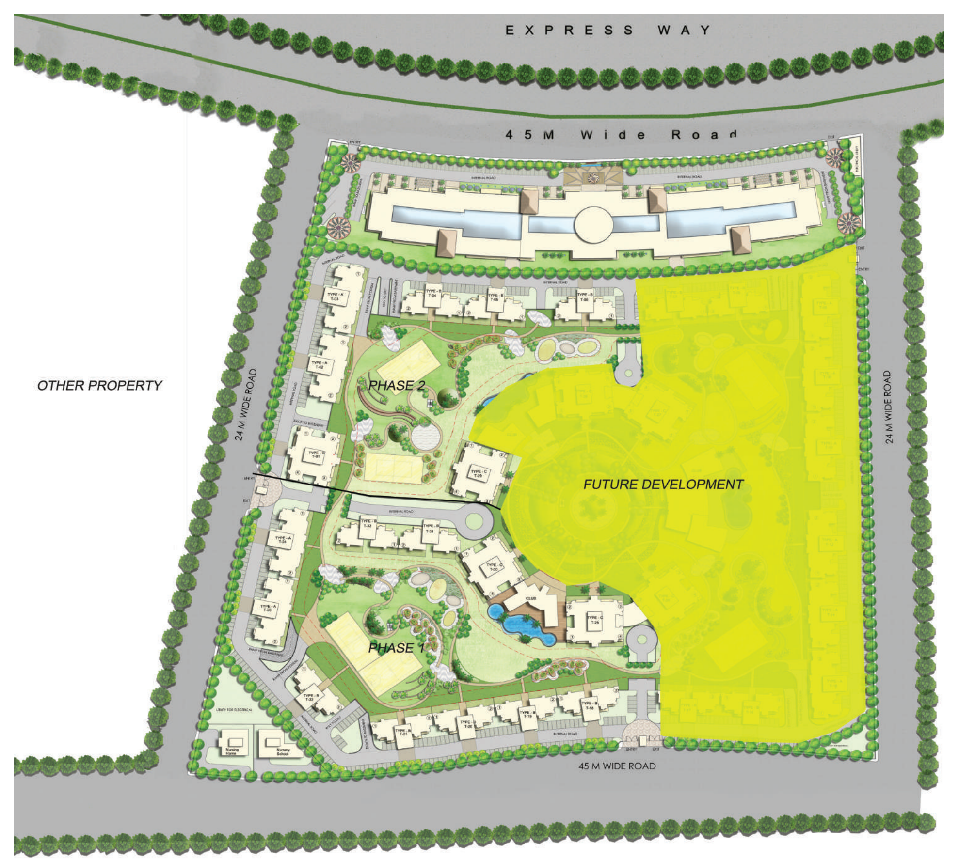
NOTE: The site plan shown is tentative. The overall layout may vary because of statutory/ design reasons. For updated layout plan, please contact sales team.