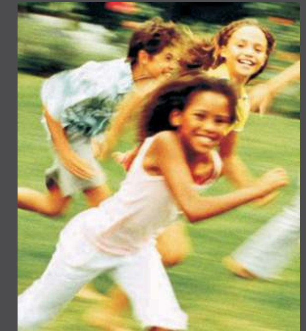
Children's play area