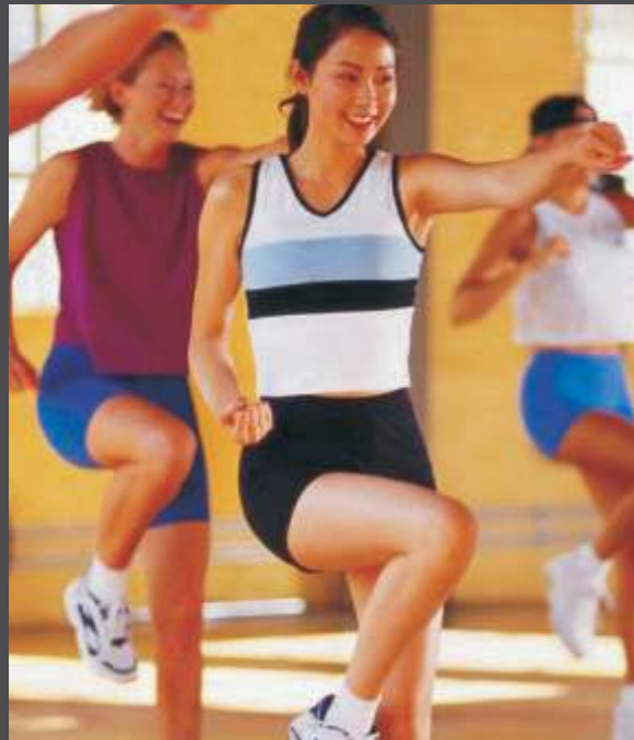
Health Club facility with recreation facilities and fully equipped unisex gym

Migsun Ultimo is where your search for the perfect life ends. Designed for an urban modern life, Ultimo is bedecked with all that's necessary, convenient and plush. Your home at Ultimo is the ultimate destination for life that's happy, successful and fulfilling.