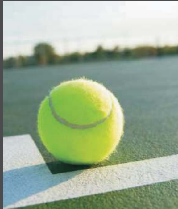
Sports facilities with Tennis Courts, Half court basketball, Table tennis & Badminton courts