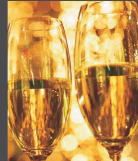
Club with lounge, Recreation room, Multi Community hall / function lounge