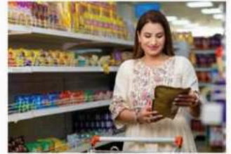
Milk & Vegetable Booth