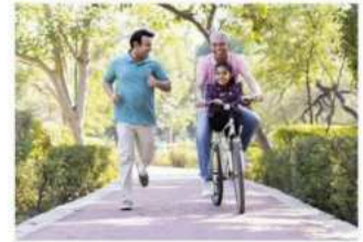
Paved Roads and Sidewalks

The images used above are merely representational and for representation purpose only.