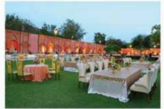
Banquet Hall with Lawn